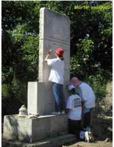
Students cleaning a deserted Jewish cemetery in Szob, Hungary, 2002. (Lauder Javne Jewish Community School in Budapest)