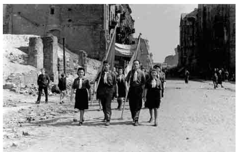
Warsaw, Poland, postwar, Memorial March for the Victims of the Holocaust.

Holocaust memorial days are a relatively new phenomenon in some countries, whereas they are long standing traditions in others. Governments have initiated and organized official ceremonies and special parliamentary sessions marking Holocaust Memorial Day that have been widely covered by the local, national and international media.