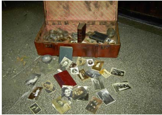
This suitcase, part of project for Holocaust Memorial Day, was created by students of the Remember Club, Vlaicu Voda National College, Romania, October 2004.