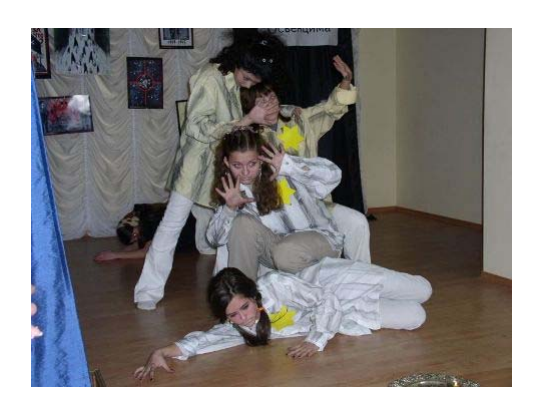
Performance by Zaporozhye JCC dance group as part of Marathon of Memory project, Ukraine 2005

On 27January 2005, the Central Ukrainian Holocaust Foundation "Tkuma" organized a project known as "Marathon of Memory", aimed at increasing Holocaust consciousness in dozens of Ukrainian towns and cities. Events included an award ceremony for students who took part in a competition about the Holocaust; "Marches of the Living" to Holocaust-related authentic sites; roundtables with students and well-known public figures; and a press conference with representatives of international and local media in conjunction with the 60th anniversary commemoration ceremonies of the liberation of Auschwitz–Birkenau. In Odessa, the commemoration featured a combination of literary and artistic images and stories by Elie Wiesel, a Holocaust survivor and Nobel laureate. State and local officials throughout the country participated in these events.