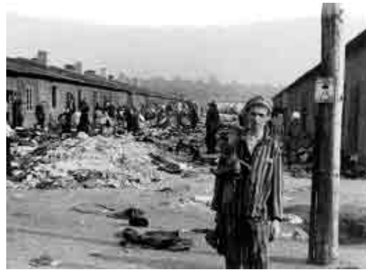
A former inmate near barracks in the camp, Bergen-Belsen, Germany.

Educators may wish to organize meetings with living witnesses (especially Holocaust survivors as well as liberators and rescuers), who can recount their experiences during the Second World War with students on this day. Live testimonies are very powerful and can contribute to a profound learning experience for students. In addition, previously recorded visual history testimonies can also be effective teaching tools. Teachers may wish to concentrate on what students learned from hearing the personal stories of witnesses and what they carry with them after listening to survivors' testimonies.