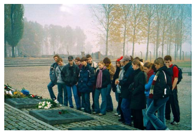
Laying flowers at the memorial in Birkenau, 27 October 2004. Russian high-school students from Moscow participated in the seminar "Auschwitz - History and Symbolism" organized by the education centre of the Auschwitz-Birkenau State Museum.