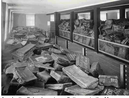
Auschwitz, Poland, postwar, Suitcases in the Museum, Yad Vashem

In Norway, the Directorate of Primary and Secondary Education encourages all schools to commemorate Holocaust Memorial Day and provides educational resources on its website. Many schools organize poetry readings and exhibitions, whereas others co-ordinate local torchlight processions and invite Holocaust survivors and witnesses to recount their personal stories.