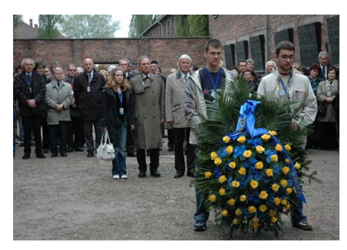
Laying a wreath at the Wall of Death in the courtyard of Block 11 at Auschwitz I-Stammlager. Youth delegations and the Ministers of Education of 48 State Parties to the European Cultural Convention, participants of the international seminar "Teaching Remembrance Through Cultural Heritage", Cracow and Auschwitz-Birkenau, Poland, 4-6 May 2005.

In October 2002, the Ministers of Education of the Council of Europe member states passed a resolution that a "Day of Remembrance" should be instituted in all schools in their respective countries to commemorate the Holocaust. In addition, during its sixtieth general assembly plenary meeting in November 2005, the United Nations decided to make 27 January an international day of commemoration to honour the victims of the Holocaust, and urged member states to develop educational programmes to impart the memory of this tragedy to future generations. <sup>2</sup>