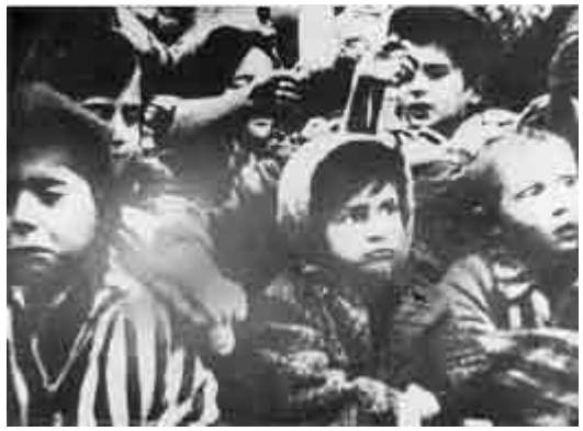
Children in the camp, raising their hands at the time of liberation, Auschwitz, Poland.