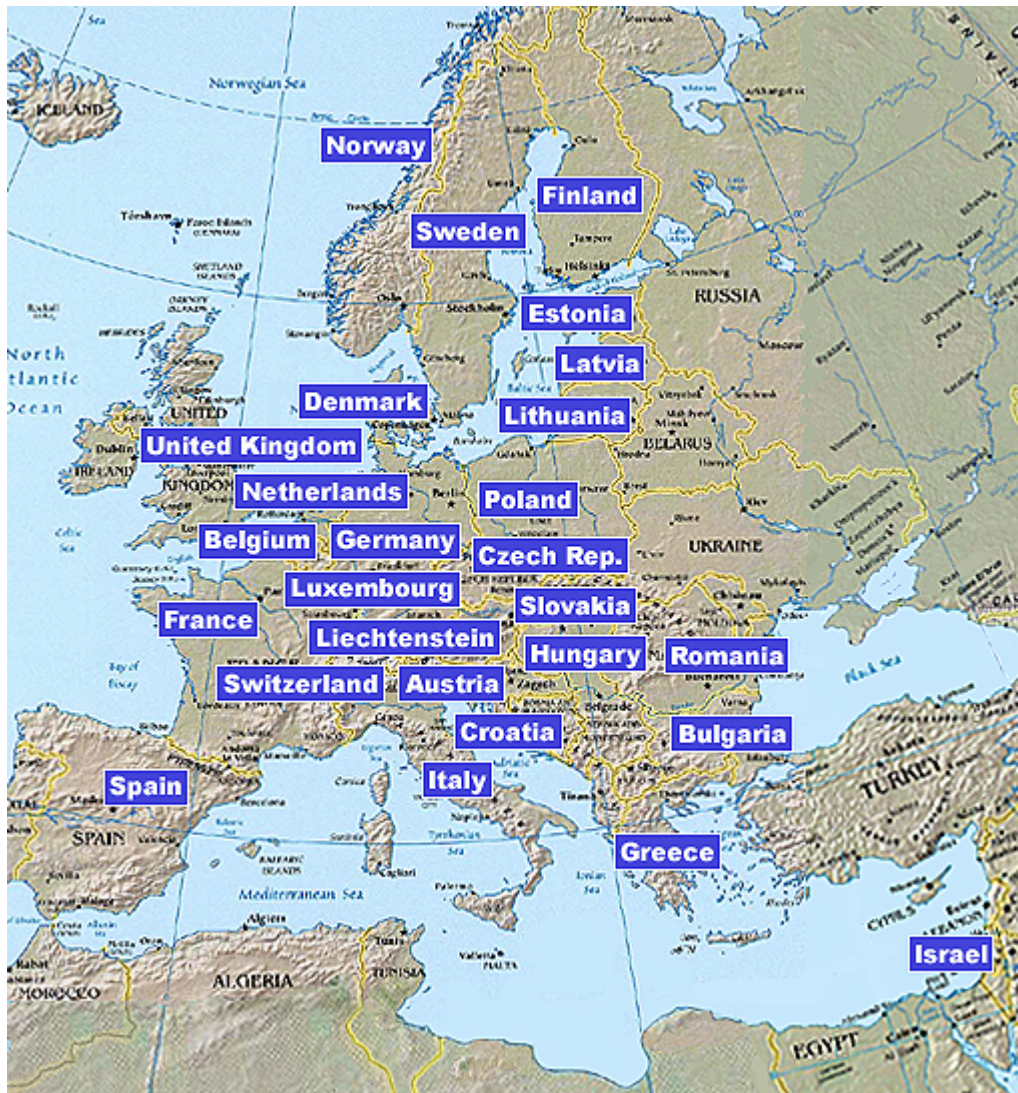
Click on the country names for details of Holocaust remembrance activities. This interactive map is also available at <a href="http://www1.yadvashem.org/education/ceremonies/liberation/map/map.html">http://www1.yadvashem.org/education/ceremonies/liberation/map/map.html</a>.

Educators who live in countries without official Holocaust remembrance days may wish to embark on a research project with their students on the Holocaust, especially in relation to what happened in their countries at that time.