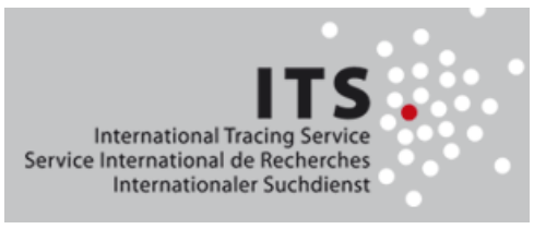
International Tracing Service