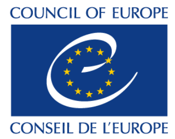
Council of Europe